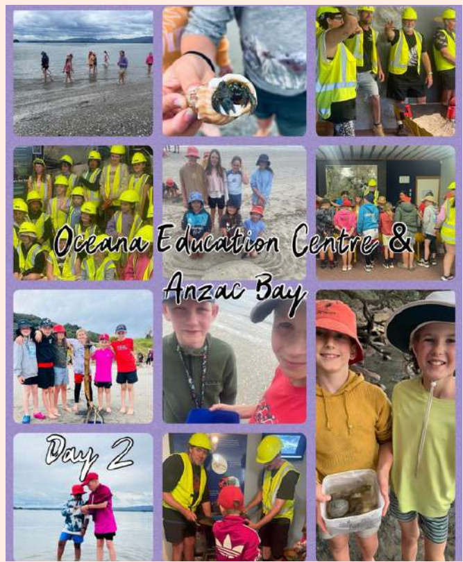
Oceana Education Centre & Anzac Bay