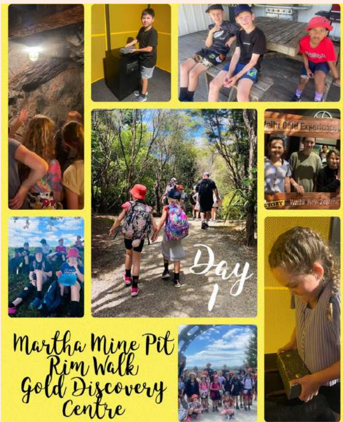
Martha Mine Pit Rim Walk Gold Discovery Centre